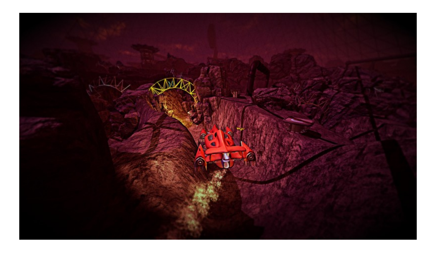
Legend Of Miro Crack Full Version Download